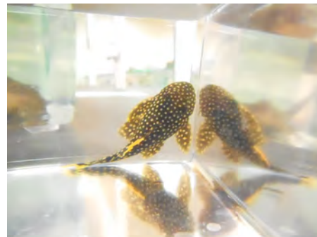
Jesse Schumacher's Gold Nugget Plecostomus