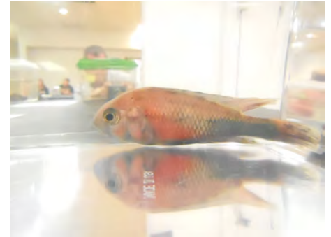
Dallas Barrett's Pytochromis sp. ‘Salmon’ (Hippo Point)