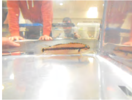
Chuck Pollet's Telmatochromis vittatus