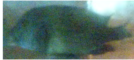
Chuck Pollet's Tropheus duboisi