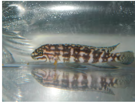
Oakes School's Julidochromis marlieri