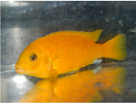
Oakes School's Labidochromis caeruleus