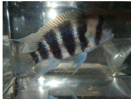
Oakes School's Cyphotilapia frontosa